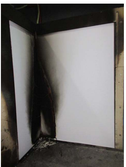
13823) After Test (EN 13823) ********* End of report********